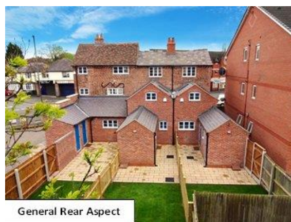
General Rear Aspect